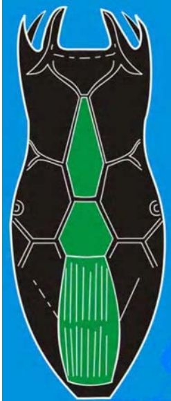
Keratella mexicana , an endemic species from Mexico